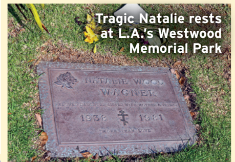
Tragic Natalie rests at L.A.'s Westwood Memorial Park