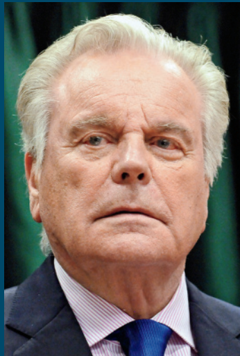
A legal expert says Wagner could be implicated in Natalie Wood's death